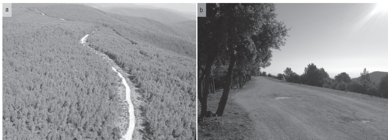
Fig. 1 Fuel treatment beside forest road: a) firebreak-like (L. Tonarelli); b) shaded fuelbreak (A. Laschi)

al. 2007). In this context, forest road density is one of the socio-economic and infrastructural factors explaining forest fire danger (Arndt et al. 2013).