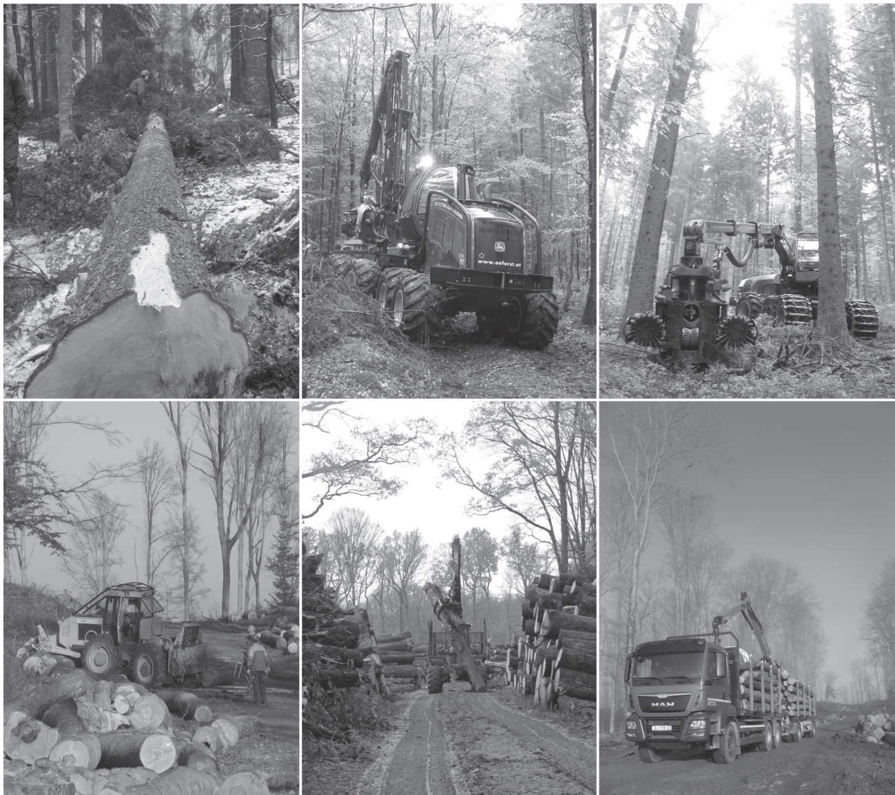
Fig. 1 From harvesting to timber transport

The use of harvesters is increasing in both coniferous and hardwood stands. While forwarders are used in lowland forests of oak and ash, skidders are in use in hilly and pre-mountainous terrain of beech, fir and spruce. Timber scaling is carried out in accordance with several regulations (by-laws) and standards, which prescribe the specifics of each log produced: tree species, length, middle diameter, log volume, place (origin) of scaling and person responsible for timber scaling, as in the EU Timber Regulation, i.e. the