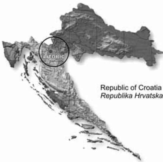
Figure 2 Site of research Slika 2. Prikaz mjesta istraživanja