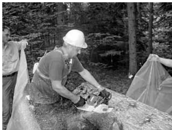
Figure 1 Cutter with attached dust samplers Slika 1. Sjekač s pričvršćenim uređajima za skupljanje uzoraka prašine

The mass concentration of respirable particles and total dust were determined by gravimetric method in compliance with the standard ZH 1/120.41, 1989, by use of personal collectors defined by the standard EN ISO 10882-1:2001. Personal collectors manufactured by Casella (produced in Bedford, UK, 2001) were fixed by straps on the cutter's body so that the suction parts, cyclones equipped with filters were positioned in the breathing zone (Figure 1), and the driving device (electric pump) on its back (Figure 3), so as not to stand in the way of cutting and processing. The separators of non-respirable particle fraction (cyclones) operate in a way similar to the separation of respirable particles in the medium effective (50 %) respiratory system of a healthy adult, with an aerodynamic diameter of 5 µm. The measurement was performed by use of a micro-scale METTLER-TOLEDO MX-5 (produced in Greifensee, Switzerland, 2000) capable of precise measurement and reading of values to 10 -6 gram, with measurement error of ± 10 -4 gram. In the process of sampling, the air flow rate at the suction head was 2 L/min (EN ISO 10882–1:2001).