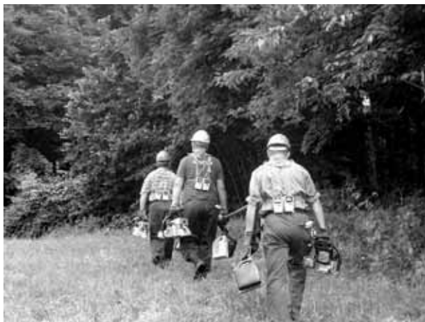
Figure 3 Cutter going to the felling site with driving device on its back Slika 3. Odlazak sječača u sječinu s pogonskim uređajem na leđima

The research was carried out in the mountainous part of Croatia (Litorić, Gorski Kotar) as shown in Figure 2 at an altitude of 750 m. The compartment is of an area of 22.77 ha with 70 % coverage. This stand is made of fir and beech with a total growing stock of 306 m 3 /ha of which fir accounts for 48.4 %, beech for 39.1 % and other hard-wood broadleaved species for 12.5 %. In the compartment 465 trees were marked for felling with a mean volume of 1.71 m 3 , and the mean volume of fir was 1.81 m 3 .