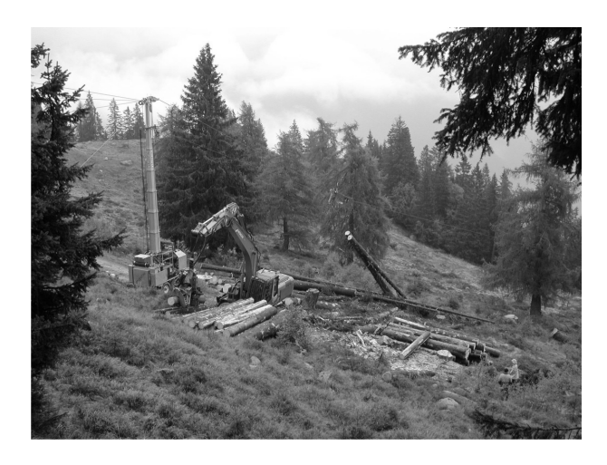
Fig. 2 Representative cable logging operation

This study focuses on cable logging (Fig. 2), which is the backbone of steep slope harvesting world-wide (Bont and Heinimann 2012). In 2012, there were over 350 cable logging contractors in alpine Italy alone (Spinelli et al. 2013). On steep terrain, cable logging is the cost effective alternative to building an extensive network of skidding trails and results in a much lower site impact compared to ground based logging (Spinelli et al. 2010). On the other hand, cable logging is inherently expensive because it is normally de-