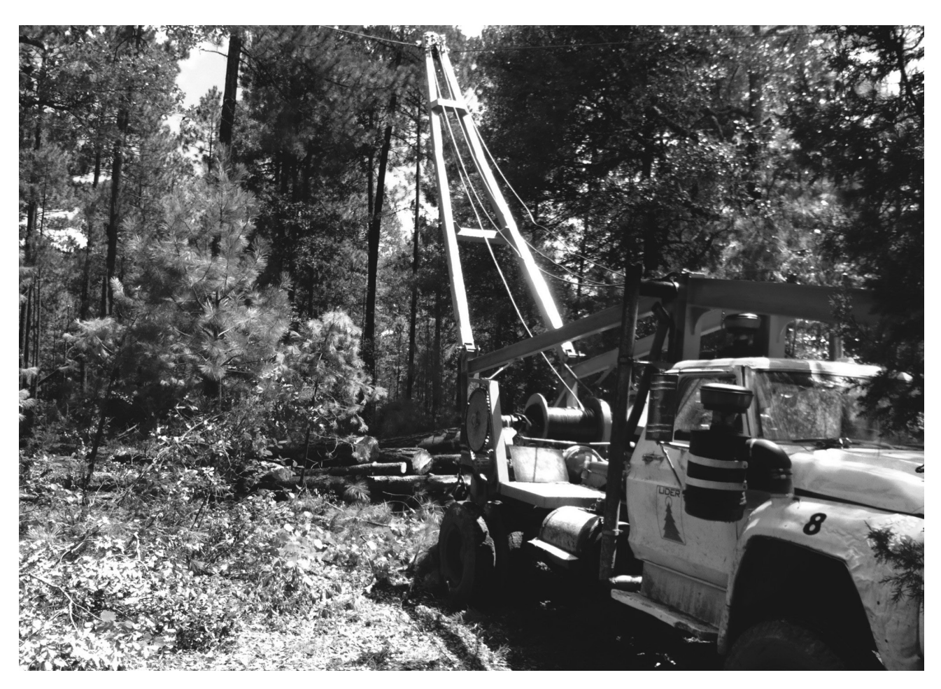
Fig. 1 Jammer with one reel, which is the type commonly used in timber harvesting operations in Mexico

C. Hernández-Díaz et al. Impacts of Forest Roads on Soil in a Timber Harvesting Area in Northwestern Mexico... (259–267)