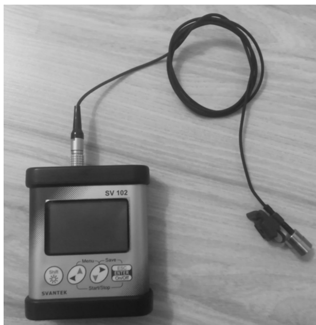
Fig. 2 Svantec SV 102 Dosimeter

Average sound pressure levels were calculated according to Eq. 3 (Figlus et al. 2013):