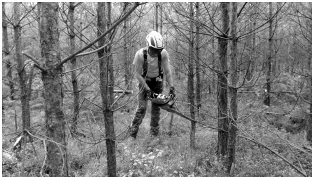
Fig. 1 Overview of the study plot in a 14-year-old pine stand

between rows was 1.5 m. The study examined the efficiency and noise emission of two chainsaws – one using battery power and the other using petrol. In total, 14 repetitions were made, 7 for each type of chainsaw. To maintain transparency and repeatability, the trials were conducted in similar weather. In addition, all repetitions were performed by the same operator, who was experienced in forestry work.